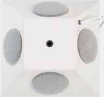
An overhead view of the LA-ILP showing its four drivers, plenum-rated cable connection and central mounting hole.

i The LA-ILP model is designed for use in low-profile plenum installations. However, it can also be used under raised flooring.