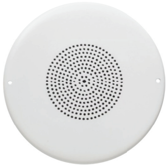
For mounting in hard ceilings, fit the Chicago Loudspeaker with a white metal plate (LA-CHCP).

The loudspeaker and the junction box housing the hub are designed to meet Chicago's stringent requirements. The enclosure and junction box are made of steel. Cabling is contained within Flexible Metal Tubing listed for use in plenums and other air-handling spaces. Where it enters the enclosure, this specialized conduit terminates in a one-piece zinc connector fitted with a rubberized polymer gasket, forming the smoke-tight seal required by the NEC. The junction box is also sealed. A flame-retardant fabric located below the speaker grille prevents dust accumulation.